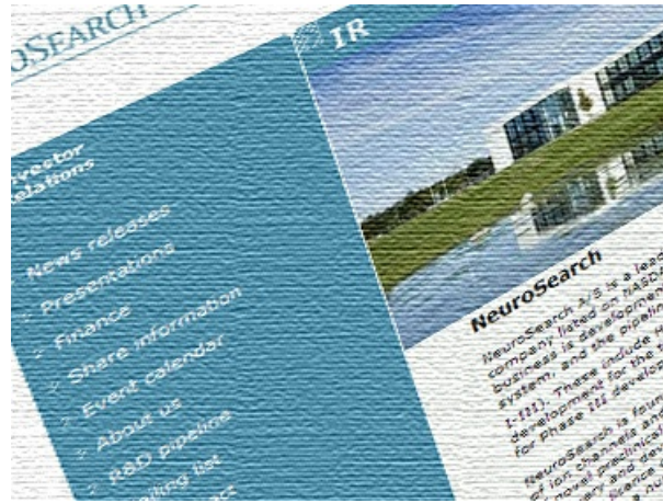
Neurosearch is a pharmaceutical company based in Denmark

Like MermaiHD, patients treated in the HART study ended up with movement scores that were better on average. Again, the study didn't show a significant improvement in voluntary functioning that had been hoped for - but that is not surprising since it was smaller and shorter. A dose-response relationship was found, which suggests that the drug is acting in the way we would expect.